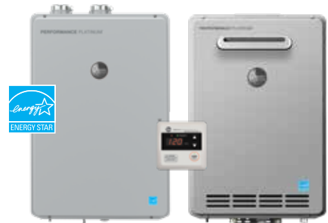
Indoor Direct Vent

See Warranty Certificate for complete information