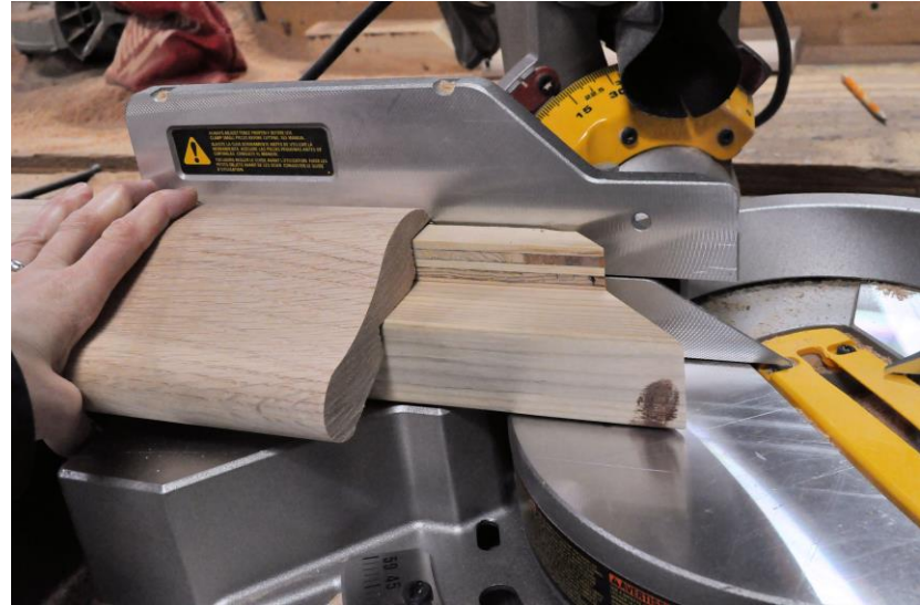
Bar rail in jig at same attitude as installed