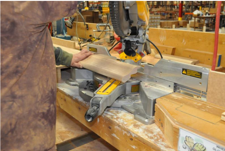
With bar rail in position cut at desired angle with saw vertical