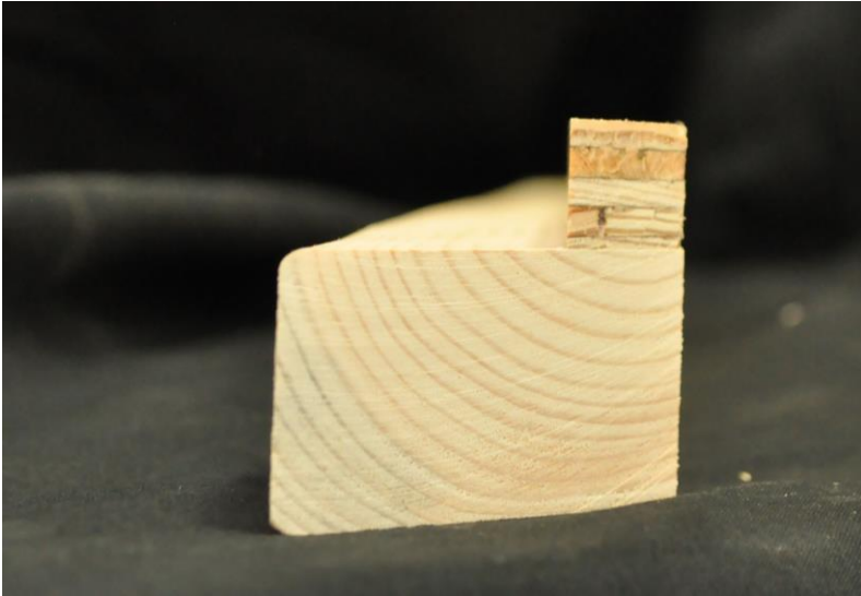
Construct jig to match bar rail installation