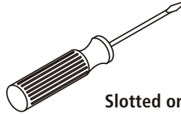
Slotted or Phillips Screwdriver