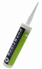
C Redi2Bond Silicone Model #: R2BSIL