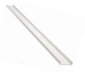
D Perimeter Channel Model #: VCHAN3