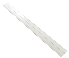
A 3-in Track Spacer Model #: 3INTRACK