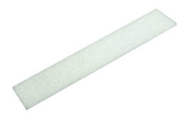
C Expansion Foam Model #: FOAMEXP3