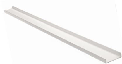
B Perimeter Channel Model #: VCHAN3