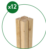
x12 8in. x 2.5in. x 2.5in. Short Posts