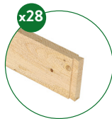
x28 4ft. x 3.5 in. Boards