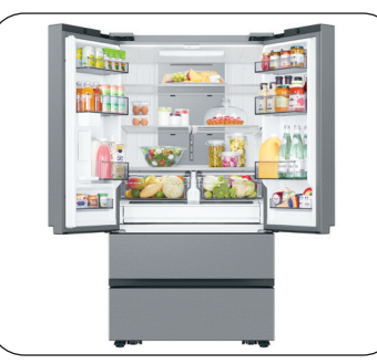
Mega 31 cu. ft. Capacity