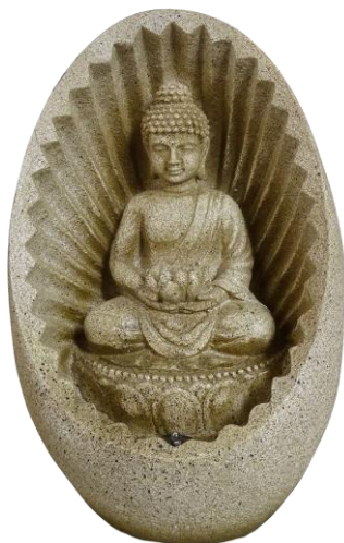
Fountain (Pump & LED lights pre-installed) 1x