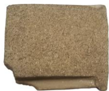
Fountain Back Door 1x