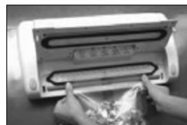
SEAL the open end, lay bag evenly along the Seal Strip