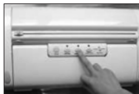
Press SEAL, when finished press both unlock buttons and open lid