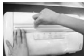
Cut bag, using cutter