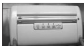
Close lid and lock, two clicks will be heard