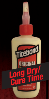
Yellow Glue (Poly Vinyl Acetate)