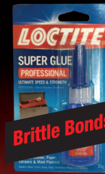
Super Glue (Cyanoacrylate)