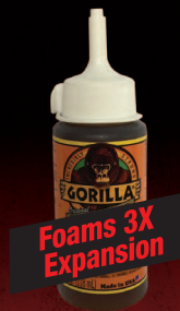
Gorilla Glue (Polyurethane)