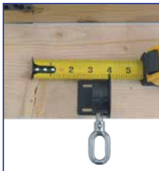
(Pole) Wall/Ceiling: 1.5" Width