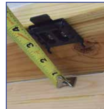
(Pole/Motor with Valance) Ceiling: Behind, 1"