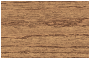
Early American B3516