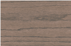
Classic Gray B3512