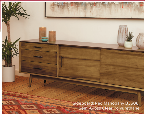
Sideboard: Red Mahogany B3508, Semi-Gloss Clear Polyurethane