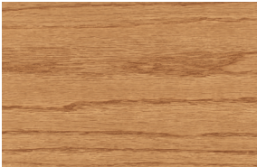
Golden Pecan B3522