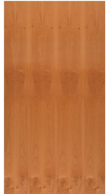
Alder Plain Sliced B