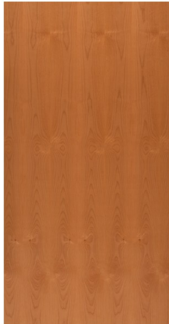
Alder Plain Sliced A