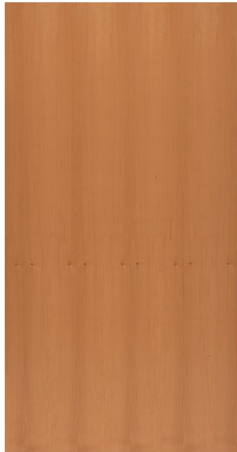
Alder Plain Sliced A