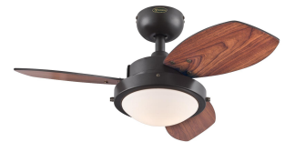
Reversible Dark Cherry Finish Blades