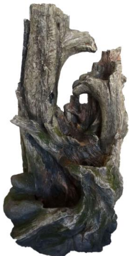
Fountain (3 LED lights pre-installed) 1x