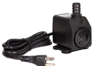
Fountain Pump 1x