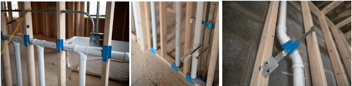
Highly versatile: Secures pipes in a wide variety of locations and positions