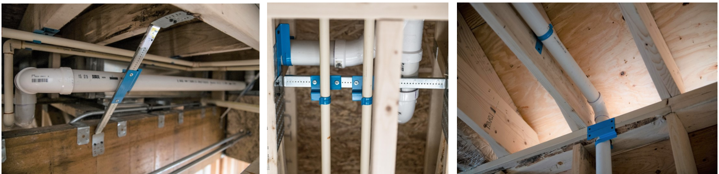
Outside of the wall: For installation applications that need to be mounted on beams or joists