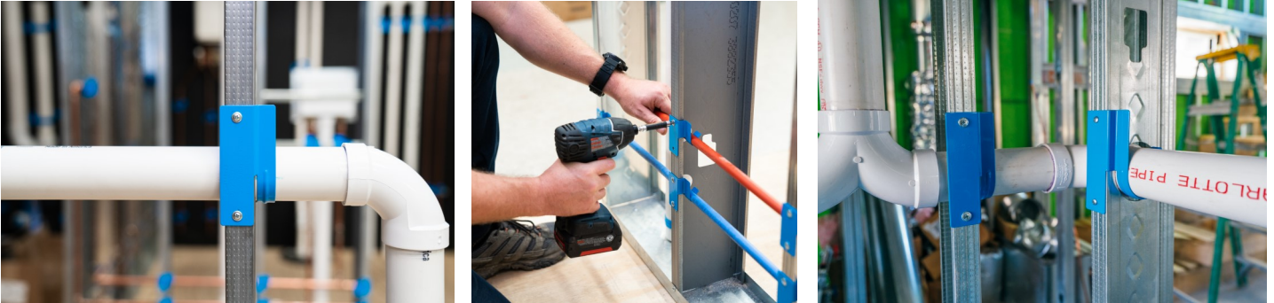
Inside of the wall: Holds and Protects pipes for both wood or metal studs