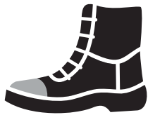
Steel Toe boots