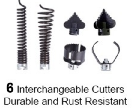
6 Interchangeable Cutters Durable and Rust Resistant

With 6 quick-change cutters included, this sewer machine excels in clearing various blockages, making it ideal for professional drain cleaning tasks. From unclogging toilets to sinks and floor drains, it offers versatile applications in homes, offices, and public spaces.