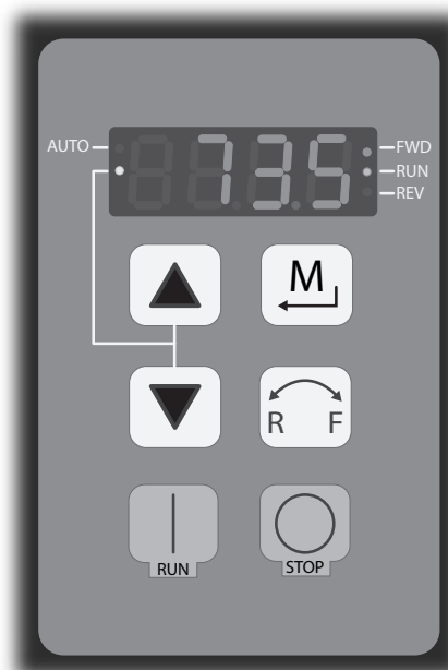
Fan speed percentage display (73.5% running forward)