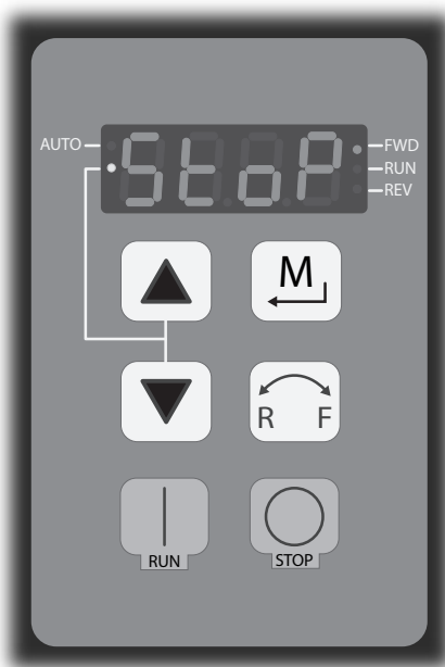
Drive idle/stopped screen