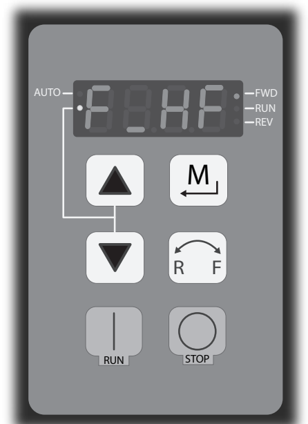
Typical fault message display (incoming line over-voltage shown)