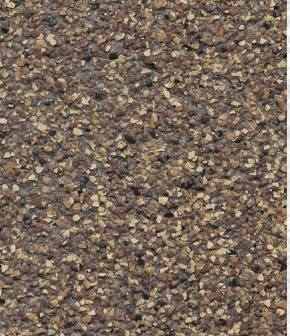
Autumn Mountain GG-14