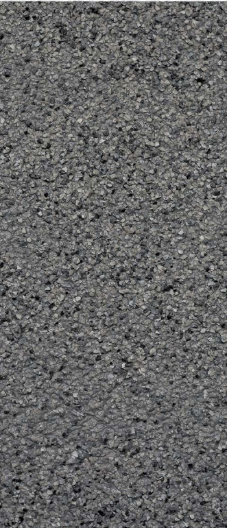
Gray No. 650