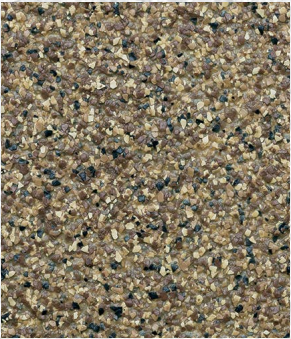
Pebble Sunstone GG-13