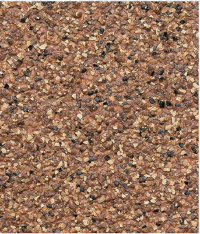
Copper Marble GG-10