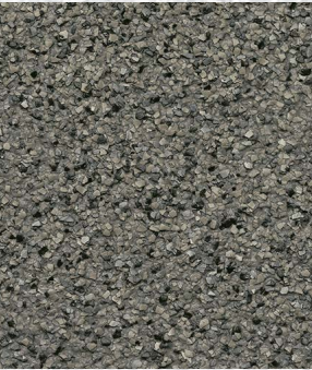
Mission Olive GG-18