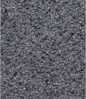
Galaxy Quartz GG-08