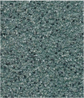
Stone Valley GG-02