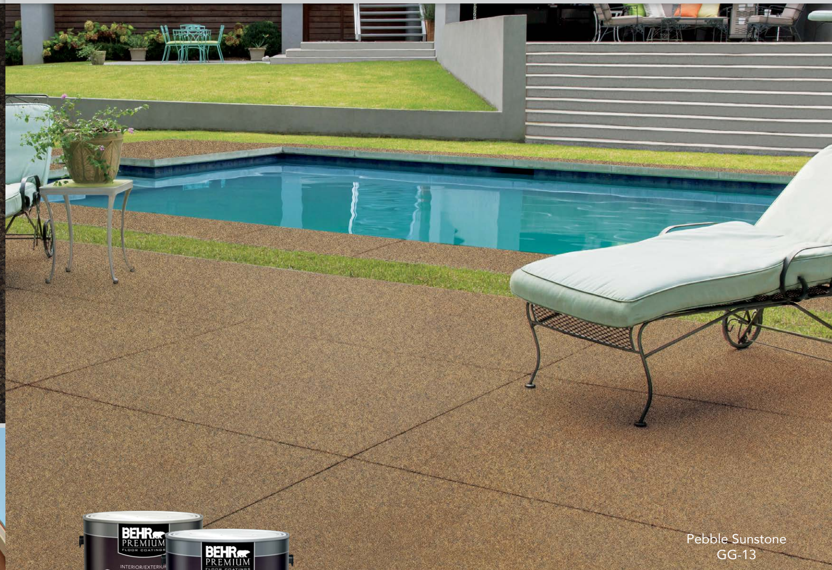
Pebble Sunstone GG-13