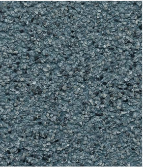
Azul Diamond GG-05