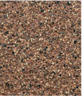
Sunset Ridge GG-09