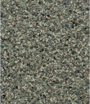
Imperial Jade GG-12