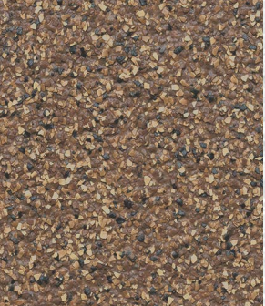
Baltic Stone GG-16