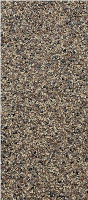
Tan No. 655