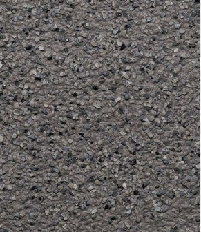
Ornamental Gem GG-07

2 coats required for optimum color match, durability and coverage.