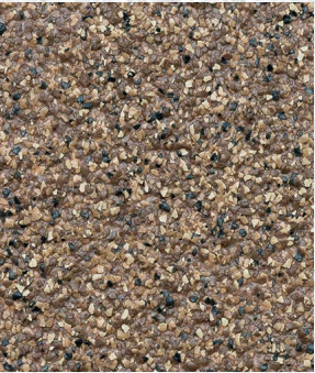
Sahara Canyon GG-11