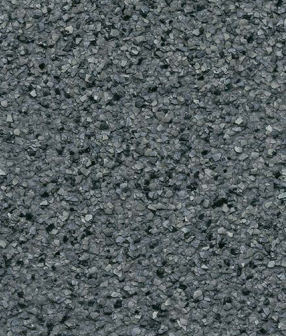
Mineral Gray GG-17