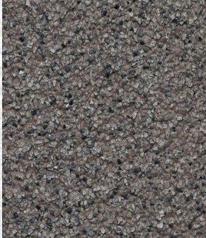
Atlantic Topaz GG-03