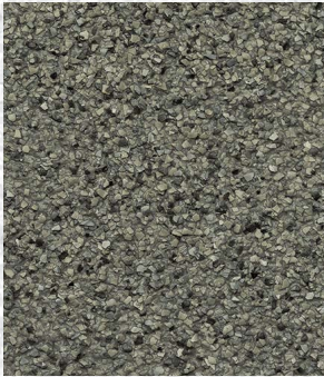
Slate Ivory GG-01