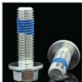
Nuts & Bolts