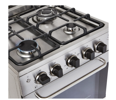
Modern knobs designed for cooktop & oven