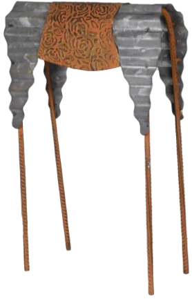
Deer Body 1x