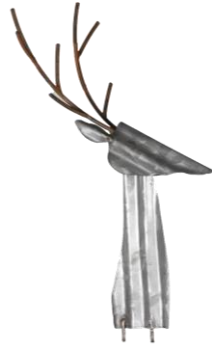
Deer Head 1x