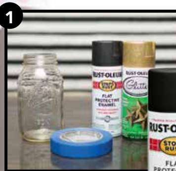
As shown Stops Rust Flat Black, Glitter Gold

Always thoroughly review directions on the package before using any product.