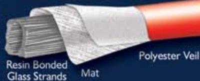
Resin Bonded Glass Strands

Our high-strength pultruded fiberglass handles provide the benefits of strength as well as corrosion, heat and weathering. This cost-effective element enables us to provide our customers with quality products at affordable prices.