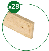
x28 3 ft. Boards