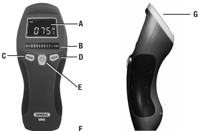
Fig. 1. The controls, indicators and physical features of the MM8

Fig. 1 shows all of the controls, indicators and physical features of the MM8. Fig. 2 shows all possible display indications. Familiarize yourself with the position and function of all components before moving on to the Setup Instructions.