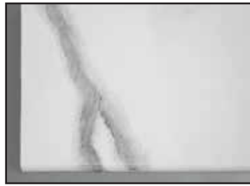
Should NOT Look like This: