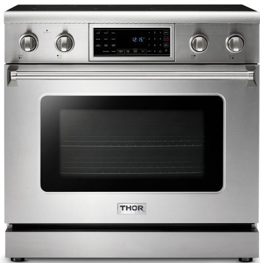
Product: 30 Inch Tilt Panel Professional Electric Range Model Number: TRE3601