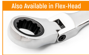
Also Available in Flex-Head