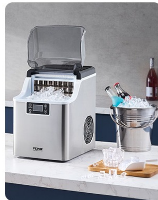
Step 3: Enjoy Ice

With simple button controls and clear indicator lights, the countertop ice machine is easy to operate.