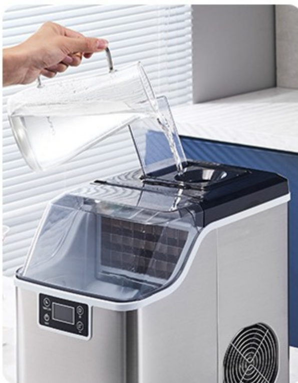
Step 1: Pour Proper Water