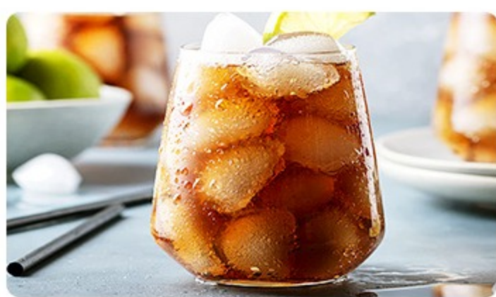
Iced Drinks & Coffee