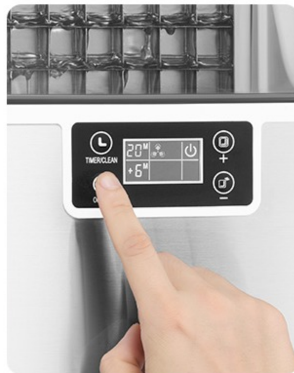
Step 2: Press Start Button