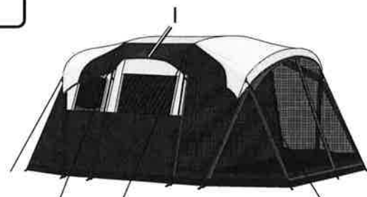
Rear view of complete tent