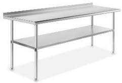
Table and Sink Assembly Instructions: