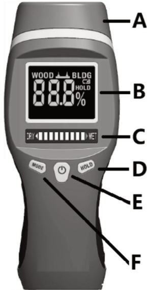
Fig. 1. The controls, indicators and physical features of the MM7

Fig. 1 shows all of the controls, indicators and physical features of the MM7. Fig. 2 shows all possible display indications. Familiarize yourself with the position and function of all components before moving on to the Setup Instructions and Operating Instructions.