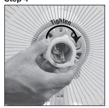
Thread Locknut onto Motor Housing to lock Rear Grille in place. Tighten=Clockwise