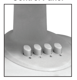
On/Off Speed Control