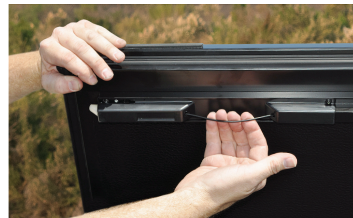
ACCESS RELEASE CABLES ON EITHER SIDE