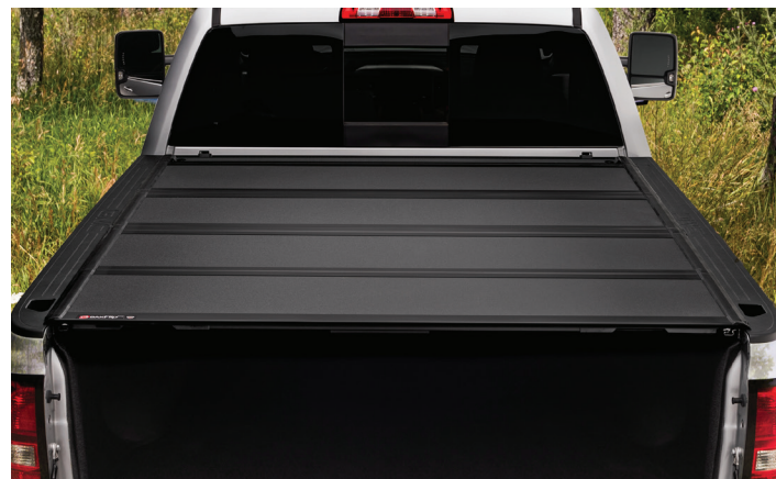
UPGRADED TAILGATE OPERATION WITH PREMIUM DUAL ACTION SEAL