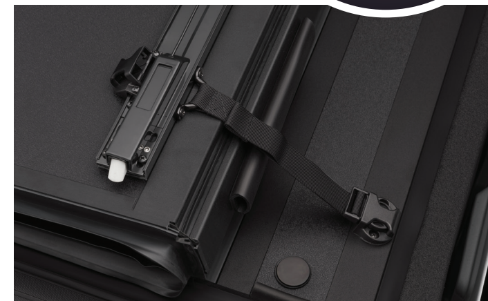
BUCKLE SYSTEM SECURES COVER IN FOLDED POSITION