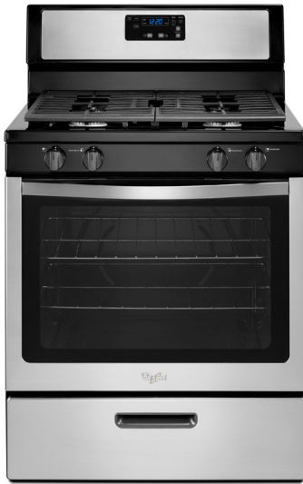
Stainless Steel WFG320M0BS