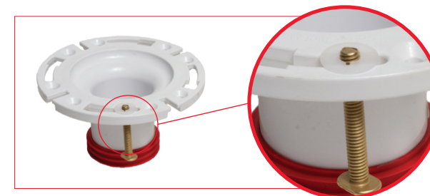
COMPETITOR'S BOLT FALLS THROUGH

The Bolt Shelf™ keeps your bolts in line without falling through. No more wobbly bolts!