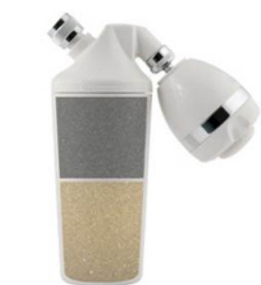
PREMIUM SHOWER FILTER

Long lasting filters only need to be replaced twice a year.