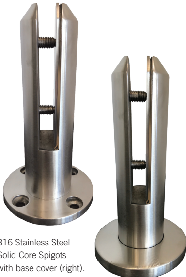
316 Stainless Steel Solid Core Spigots with base cover (right).