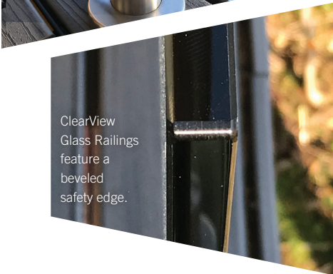
ClearView Glass Railings feature a beveled safety edge.