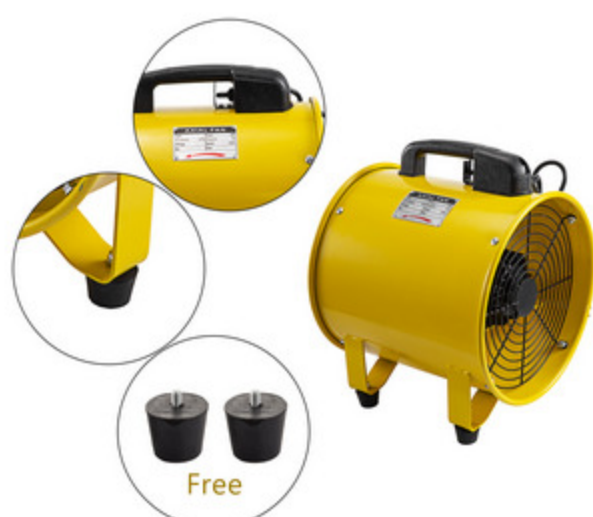
COMPACT & PORTABLE

Duct hosing applies 0.014 inch / 0.35 mm thickness vinyl weaved polyester for heat resistance and flame retardancy. D-shaped rings are designed for hanging the PVC flexible duct smoothly. Thick ropes are able to be adjusted to fit the duct's mouth size and ensure a good sealing environment.