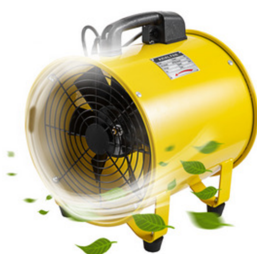
HIGH VELOCITY & POWERFUL

Utility blower fan features 550W pure copper motor with 1900 & 2800 RPM high speed fit long time ventilation work, low noise 71 dB(A). Two speeds mode is quite convenient to adjust speed according to varied needs. Plus, we applied a leak-proof GFCI Plug for your safer operation.