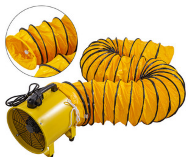
FREE 5-METER HOSE

This portable exhaust fan is designed with a high-quality steel shell, which can resist rust, compression, vibration, and deformation. As a result, a slight drop or impact will not affect the internal parts. In addition, two high-density covers prevent small animals from flying into the machine.