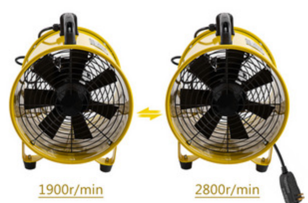
1900/2800 R/MIN SPEED