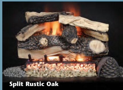
Split Rustic Oak