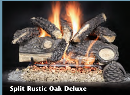
Split Rustic Oak Deluxe