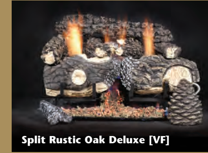
Split Rustic Oak Deluxe [VF]