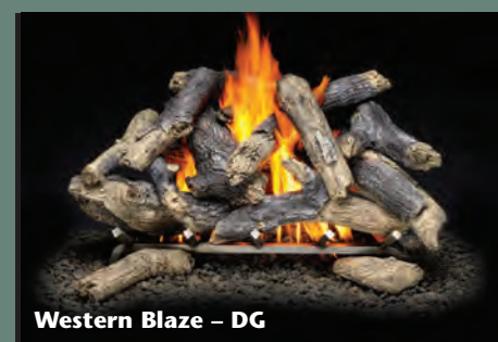
Western Blaze - DG