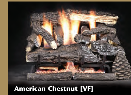
American Chestnut [VF]