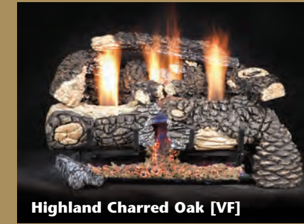
Highland Charred Oak [VF]

Combining luxury and efficiency with distinctive design elements. The efficient burner design combined with no outside venting requirement prevents heat loss and drafts.