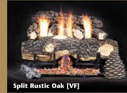
Split Rustic Oak [VF]