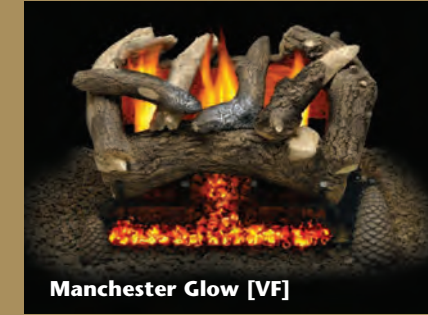
Manchester Glow [VF]