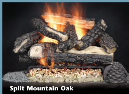
Split Mountain Oak