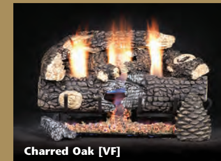
Charred Oak [VF]