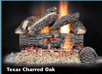
Texas Charred Oak