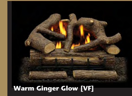
Warm Ginger Glow [VF]