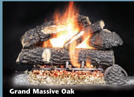
Grand Massive Oak