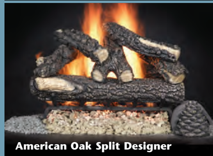
American Oak Split Designer