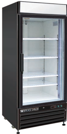
MXM1-12RB (Color: Black)

Glass Door merchandisers are designed for durability and visual appeal in promoting your product. Glass door merchandisers are energy efficient and effective at keeping product at exactly the right temperature. This keeps food fresher for longer. The simple-to-use but precise digital controls allows for accuracy in temperature and flexible use of the unit.