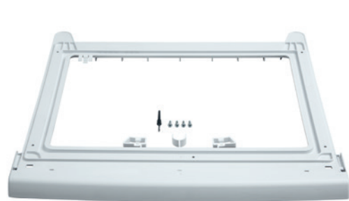
Stationary Stacking Kit WTZ20410UC