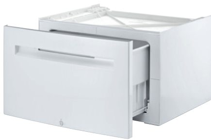
Washer Pedestal WMZ20490