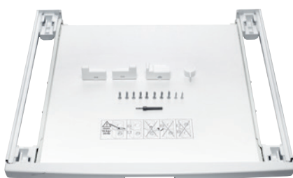
Stacking Kit with Pull Out Tray WTZ11400**