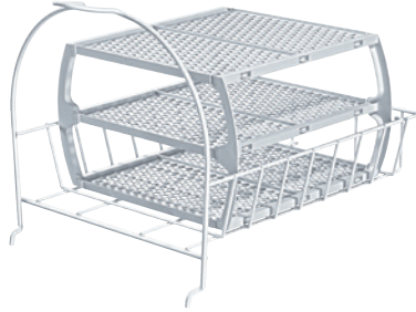
Drying Rack WMZ20600

Place delicate items, tennis shoes, or slippers on the rack accessory for gentle drying during the cycle.