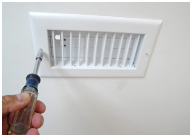
Hands Free Installation (ceiling installation)

• Speedi-GRILLE installs in just a few seconds in Speedi-BOOT applications. Clips hold Speedi grille in place and align mounting holes to Speedi-Boot mud ring. So you're hands are free to finish the job.