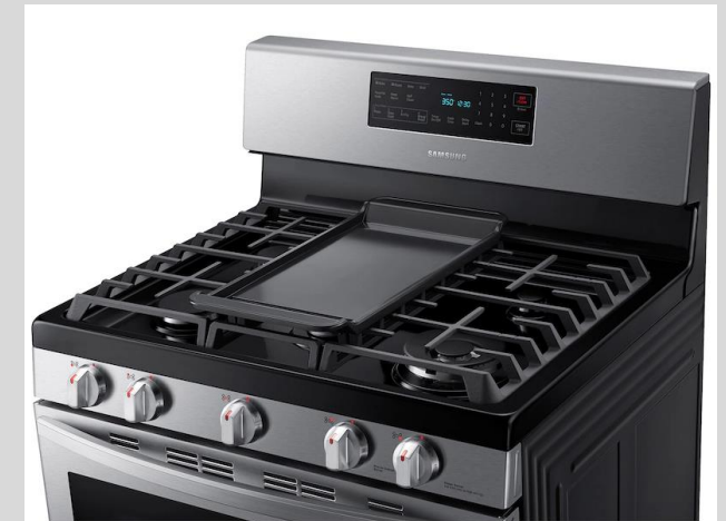
Metal Pot Stand (Grate)