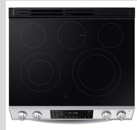
Ceramic Glass Cooktop