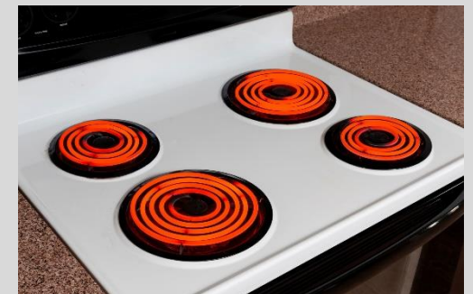
Coil Burner Cooktop