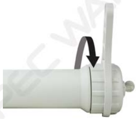
Turn counter-clockwise to open the membrane housing cap.