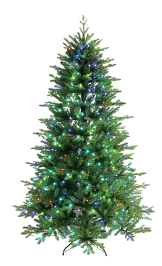
USER'S MANUAL Christmas Tree