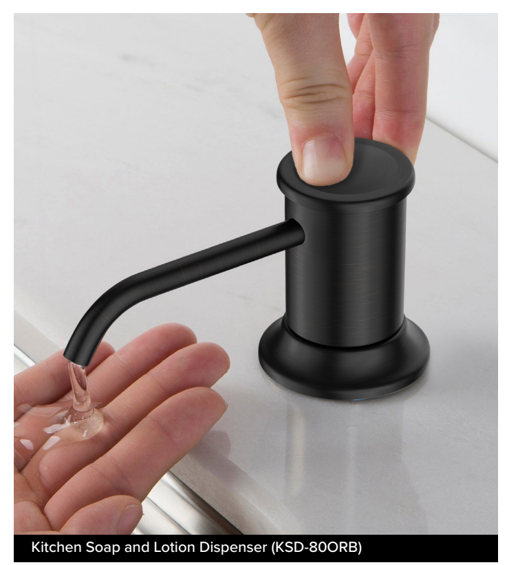
Kitchen Soap and Lotion Dispenser (KSD-80ORB)