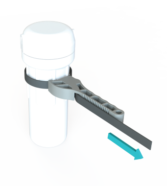
2. Slide strap around sump & pull strap towards you until tight