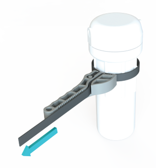
4. Slide strap around sump & pull strap towards you until tight