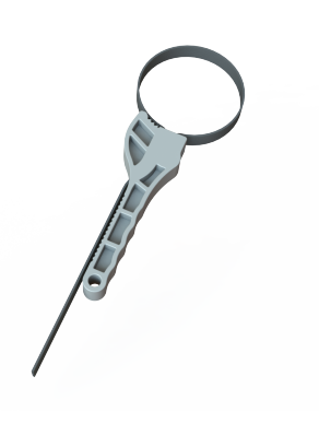
1. Flip wrench over so strap channel is facing downward