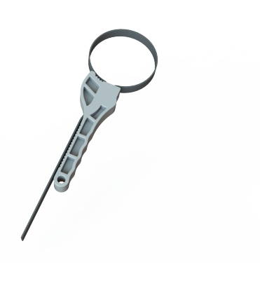
1. Flip wrench over so strap channel is facing downward