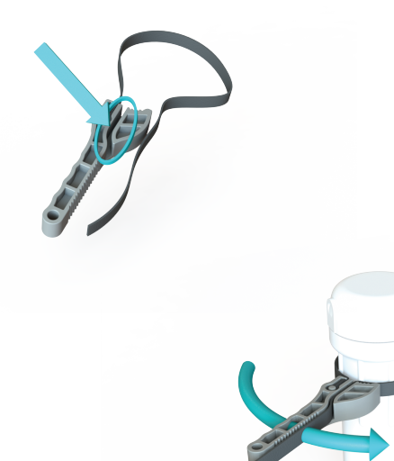
5. Turn wrench to the right/counterclockwise to tighten

3. Place strap into channel with enough slack to fit your sump