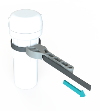
2. Slide strap around sump & pull strap towards you until tight