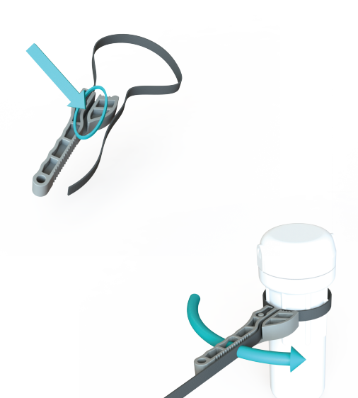
Turn wrench to the right/counterclockwise to tighten

2. Hold wrench with strap groove channel facing up