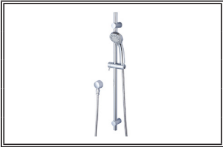
# P-4530 SHOWN